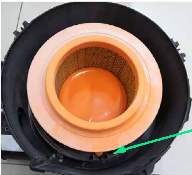
TAB IN GROOVE FITTED CORRECTLY

Make sure every time the filter is replaced that it is sitting evenly flat and that the locating tab is in the right place. Refer to images below.